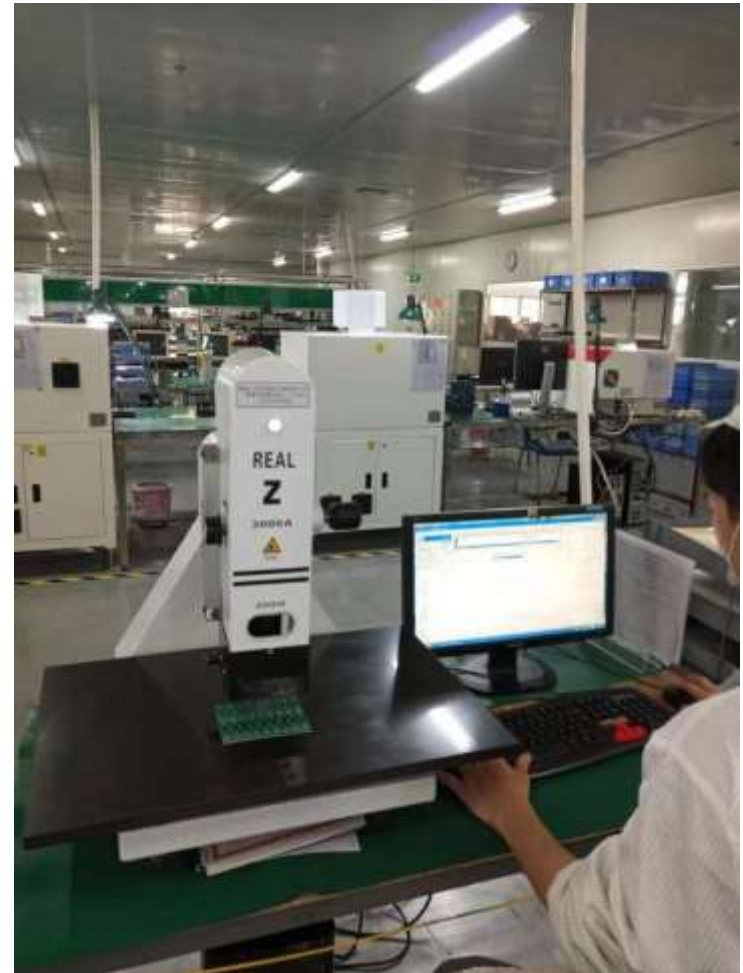
Solder Paste Thickness Checker